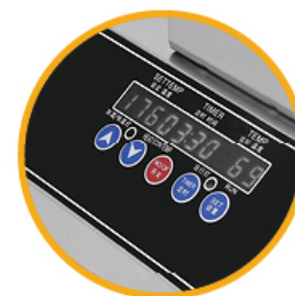
智能触控面板 Smart touch panel

On the basis of rapid heat conduction, the thickness of 2cm can be increased or decreased, and the heat distribution on the baking plate is more uniform, forming a heating surface without dead corners, and the egg color of the eggs is consistent.