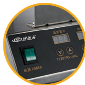
触控感应面板 Touch sensing panel