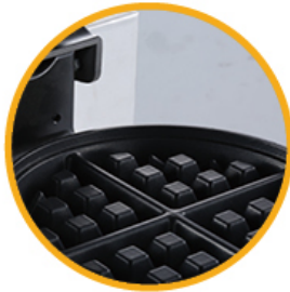
不粘涂层面板 Non stick coating panel

Temperature range: 50~300℃ Diameter: 19CM