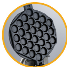
不粘底涂层 Non stick bottom coating