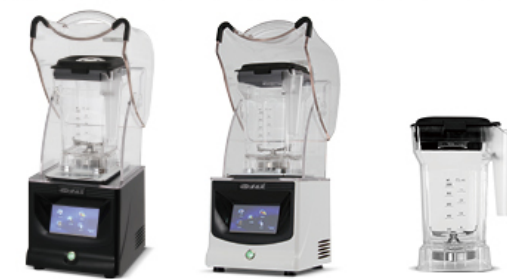
黑色款 Black paragraph