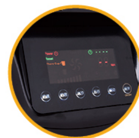
智能型显示屏 Intelligent display screen