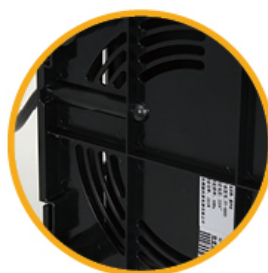
防滑脚垫 Antiskid foot pad