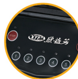
智能触控面板 Smart touch panel