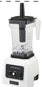
白色款 White paragraph