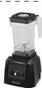
黑色款 Black paragraph